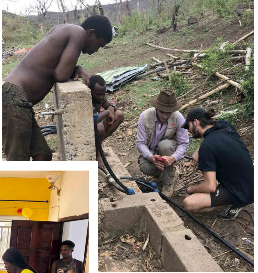
Restoration of existing water sources in the bangas of Kwale by specialized teams at Solidarités International.