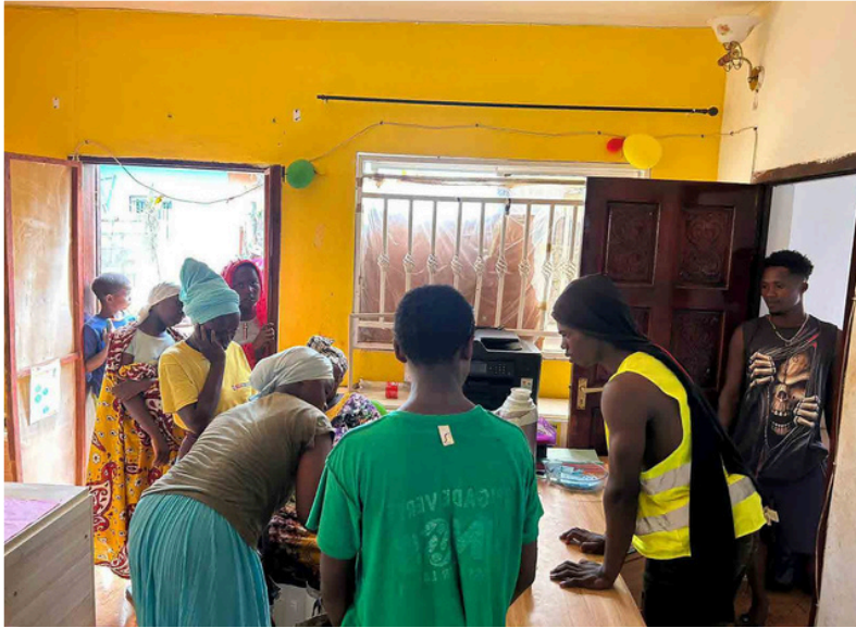
Preparation of meals by local restaurateurs with the support of the NGO World Kitchen, distributed by the Tsingoni Territory Management Association.