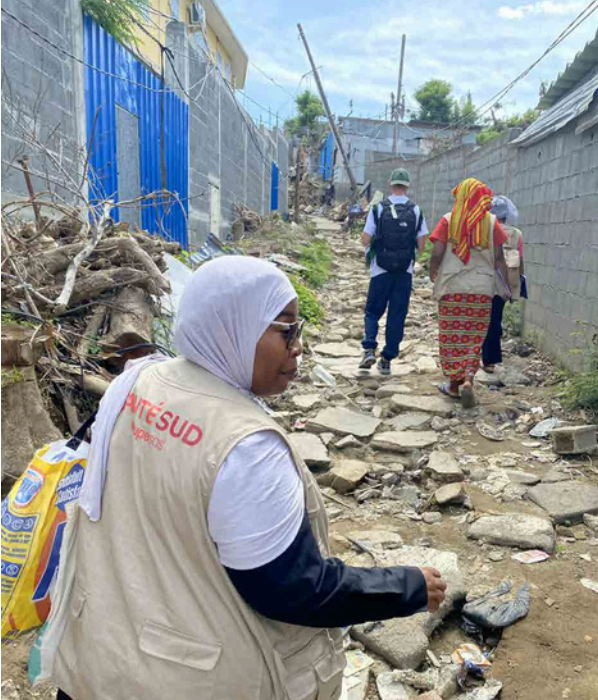
The NGO Santé Sud addresses urgent healthcare needs.

The NGO Santé Sud is deploying community-based healthcare services across the Petite-Terre region, reaching approximately 35,000 people. Its team of medical professionals is also developing an epidemiological monitoring system to help prevent public health risks.